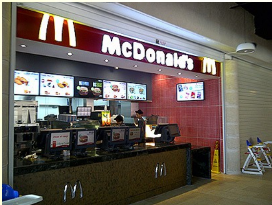
The new McDonalds at Masada