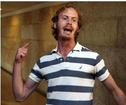
Shavuel s'chivschorder— Lost 5 family members in a suicide bombing in 2001. Threatens to kill the terrorists himself

Just Hours before the deal is scheduled to take place— a decision must be made.