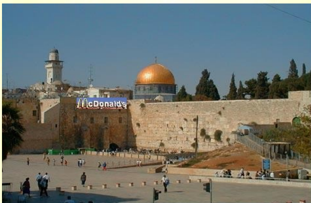
Golden arches on the Golden Dome? Who's next? (illustration)