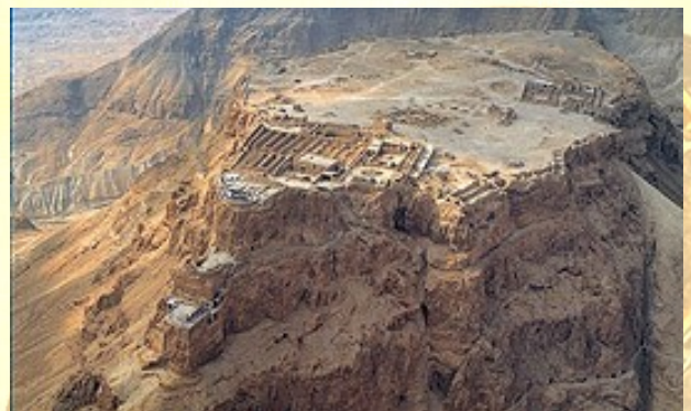
Masada— Over a million tourist a year