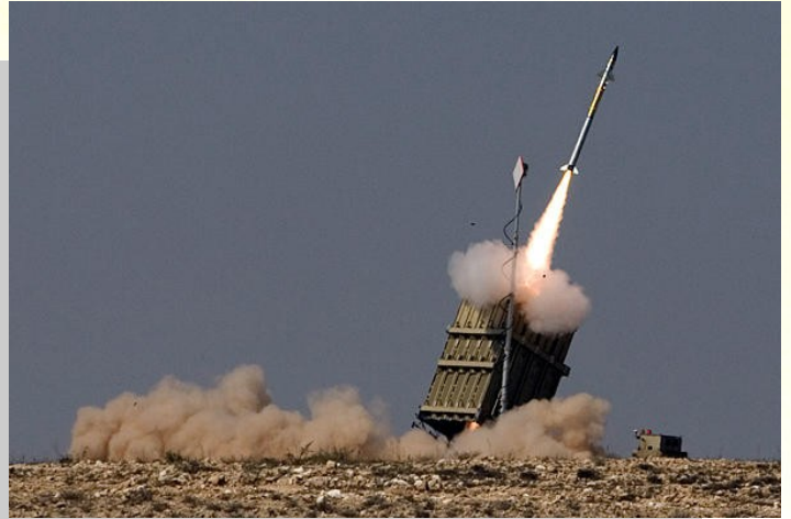
Iron Dome– Can't be spoiled and stand that noise for long

You won't see anyone demonstrate for having too many days of reserve duty, for having to built a bomb shelter in every new house on your own expenses or for having a