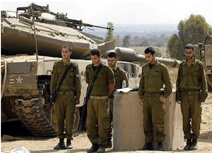
When the siren sounds on Memorial Day in Israel, the whole country stops for two minutes.

For me, Memorial Day is difficult, a day which I spend reflecting on stories of those who are gone. Some served with me, some went to my high school, some lived in my neighborhood, some I knew and some I didn't, but I feel connected to their stories. As Israel is such a small country, it's difficult to find someone who is not connected in some way to the "bereaved family." So for us, it's not just a national day, but a day of an entire nation.